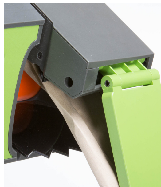
Bladeless tear-assist for safe, easy use