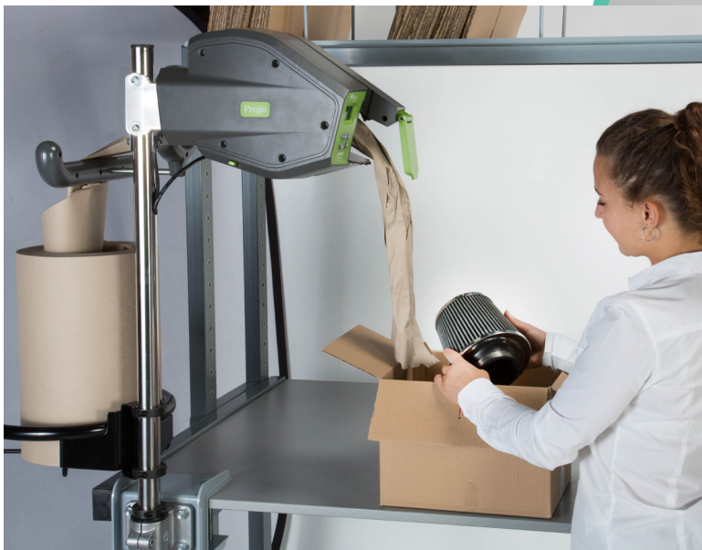
Affix to workstation for total convenience and comfort.