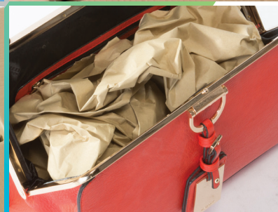
Sustainable paper void-fill is clean, flexible and lightweight.

Quantum™XT delivers 100% recycled paper at speeds of up to 1.8m per second, with the ability to have complete control of output as required to suit all kinds of packing operations.