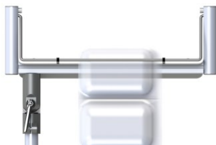
Pad holder with 200mm film