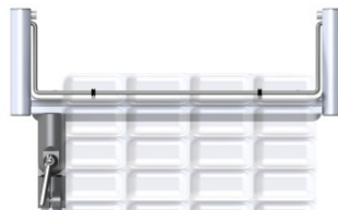
Pad holder with 400mm film