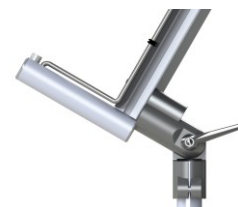
Easy to adjust and lock